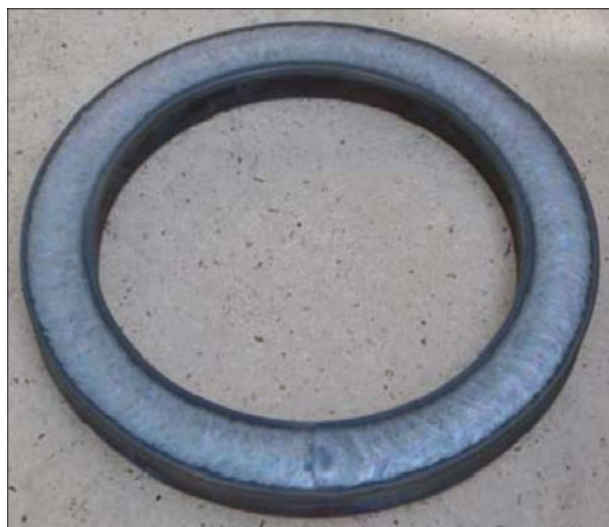
Figure 4. Slotted ring deposited by plasma-powder method