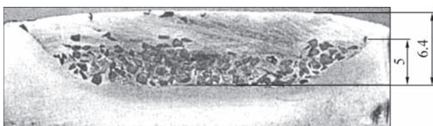
Figure 1. Typical macrostructure of deposited metal

The influence of different factors on the quality of surfacing was evaluated on macrosections by the amount of relit on the working surface of slotted rings and by the absence of defects in the deposited metal (Figure 1).