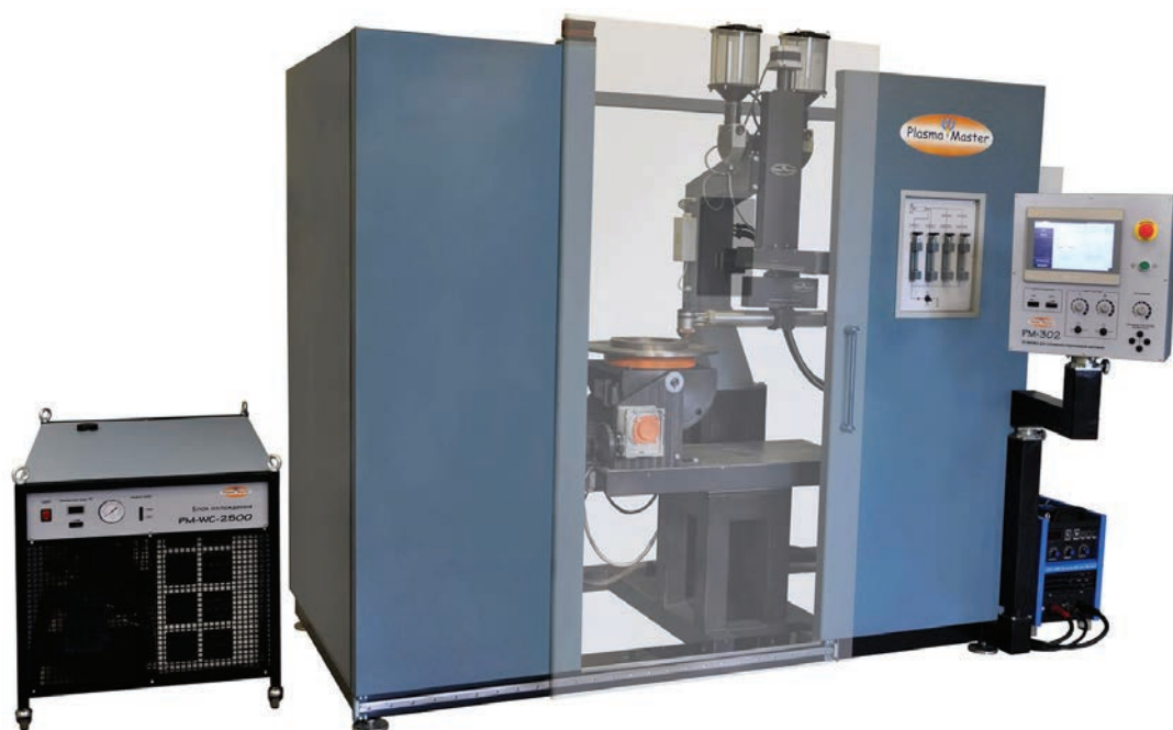
Figure 2. Installation PM-302 for plasma-powder surfacing

ticles it is 130–160 MPa [6]. The macrohardness of surfacing after grinding of its surface to the working height (2–3 mm) is within HRC 50–56. The content of relit on the working surface of deposited metal is more than 50 vol.% (Figure 3). The developed technology provides a high quality of deposited rings (Figure 4) and is successfully realized in pump building.