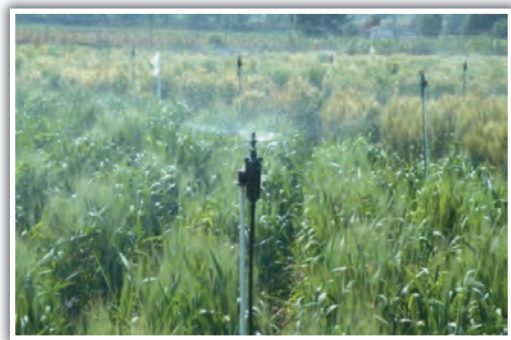
Field infections and misting system