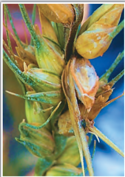
Diseased spikelets