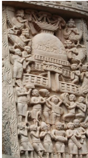
Pic. 1. Foreigners at Sanchi, India – 3 rd Century BCE