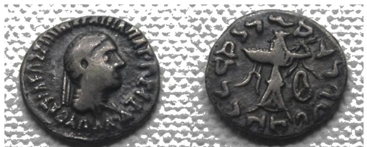
Pic. 5. Drachm of Apollodotus II - Monogram/Symbol. Below the Right Hand of the Figure on Reverse (Bimal Trivedi collection, Mumbai)