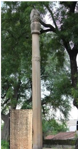
Pic. 3. Garuda Column Erected by Greek Ambassador to India, 2 nd Century BCE (MP, India)