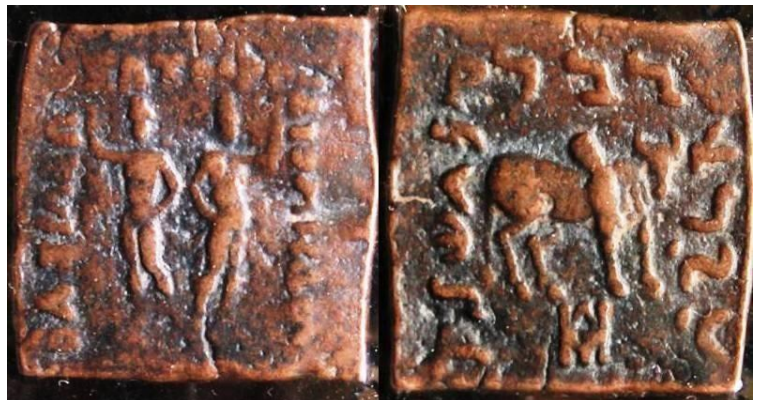
Pic. 4. Diomedes' Copper Unit: Monogram below the Bull (Bimal Trivedi collection, Mumbai)