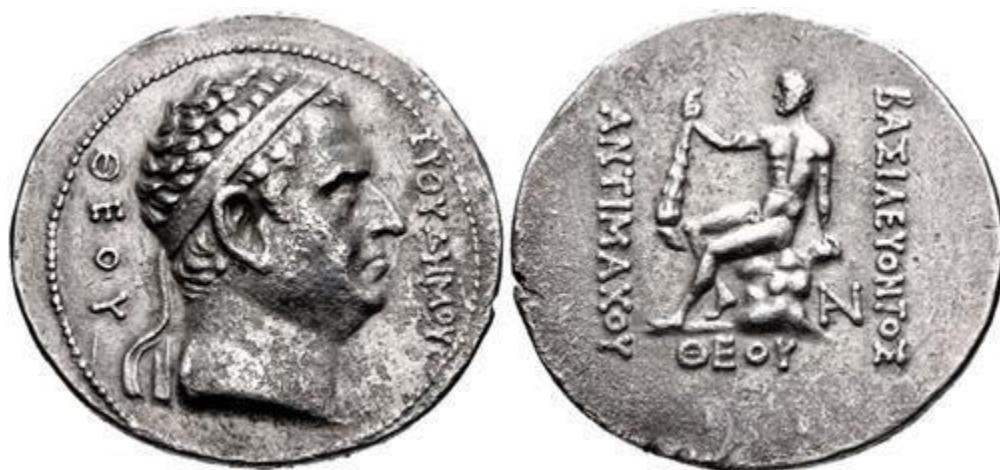
Fig. 6. The Greco-Bactrian Kingdom. Antimachos I Theos. Circa 180-170 BC. AR Tetradrachm