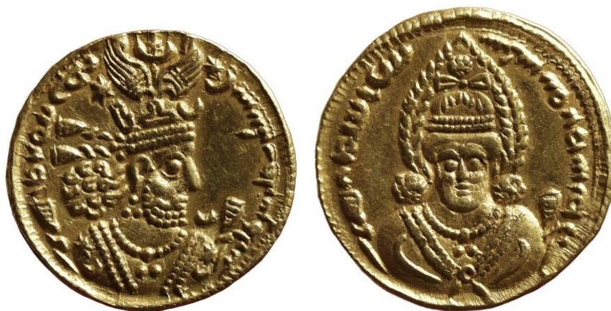
Fig. 2. Heavy dinar: dies obverse 1, reverse 2. 6.48g, 22.7 mm, 2 h (Berlin no. 450/1911)

Figs 2 to 7 reproduced at approximately 2x life size