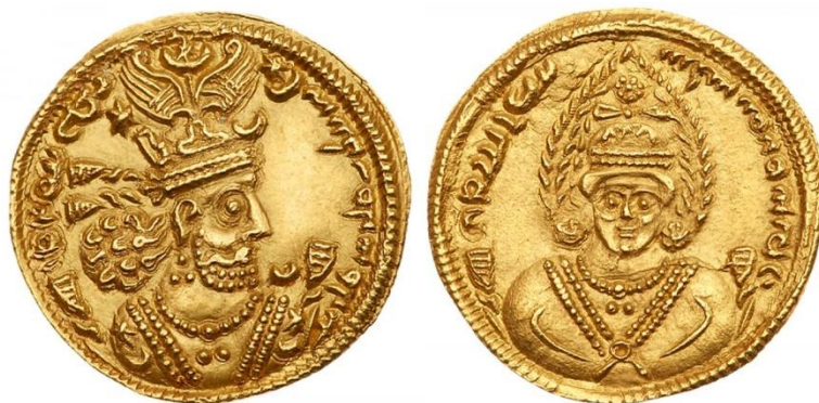
Fig. 6. Light dinar: dies obverse 1, reverse 1. 4.54 g

(Nelson 2011, no. 986 = New York Sale, auction 37 (5 January 2016), lot 638)