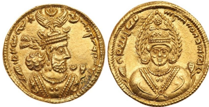
Fig. 5. Light dinar: dies obverse 3, reverse 1. 4.56 g

(Spink Taisei auction 5 (3 July 1988), lot 481 (4.47g) = NFA, NY auction 30 (8 December 1992), lot 165 = Tkalec auction (28 October 1994), lot 130 = Künker auction 318 (11 March 2019), lot 798