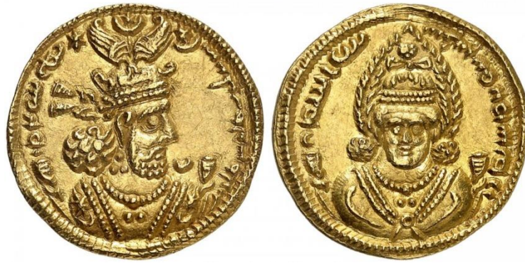
Fig. 4. Light dinar: dies obverse 3, reverse 2. 4.48 g

(Spink Taisei auction 5 (3 July 1988), lot 481 (4.47g) = NFA, NY auction 30 (8 December 1992), lot 165 = Tkalec auction (28 October 1994), lot 130 = Künker auction 318 (11 March 2019), lot 798