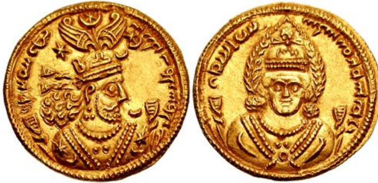
Fig. 7. Light dinar: dies obverse 2, reverse 3. 4.55 g (CNG 65 Triton 7 (12 January 2004), lot 661)