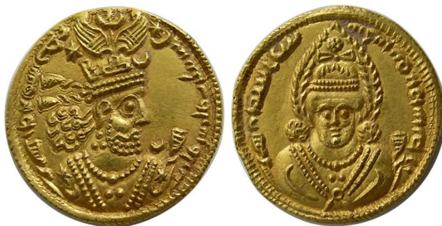
Fig. 3. Light dinar: dies obverse 1, reverse 2. 4.57 g, 22 mm (V Coins Pars, 1 April 2015)