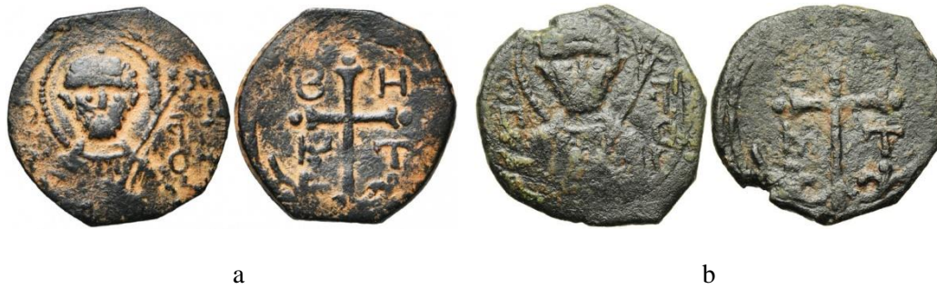
Fig. 5. Type 1

On type 1 the impression of a rather gaunt face is misleading due to wear and weak striking. The bust is in reality bearded but perhaps, as already noted, rather older and thinner than the bust on type 2. The simplest way to tell worn specimens apart is the position of the cross against the nimbus already referred to. Dardel's depiction of the reverse is accurate. There is a difference in the ornamentation of the reverse cross, which is certainly thinner (Fig. 6). Type 1 remains the rarer of the two types. Of the 30 odd examples I have noticed from recent auctions only six are type 1.