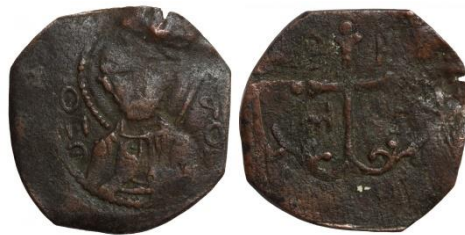
Fig. 9. Type 1 of Bohemond showing hand held in blessing

An attempt was made to check the dies but this proved difficult owing to the incomplete striking and patchy surfaces of the coins. There are certainly two obverse and two reverse dies in type 1 (compare Figs 5 and 7a). There seem to be several reverse dies for type 2. For example, in Fig. 4 lots 57 and 58 are certainly different reverse dies but it is not possible to be sure about the others. I have to say that I have so far failed to find two examples of type 2 where the obverse die was clearly different. One can certainly conclude that both series were struck from very few dies.