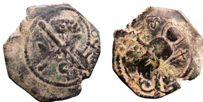
Fig. 1c. Type 3 follis of Tancred overstruck on Bohemond I