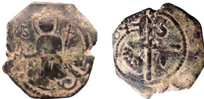
Fig. 1b. Type 3 follis of Tancred overstruck on Bohemond I