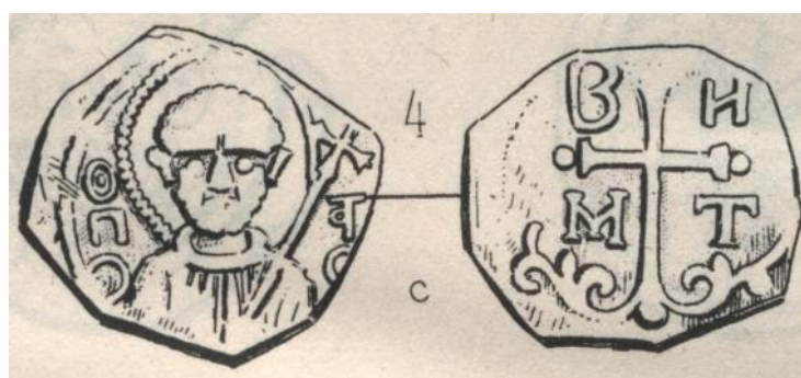
Fig. 2. Bohemond I follis illustrated by Schlumberger