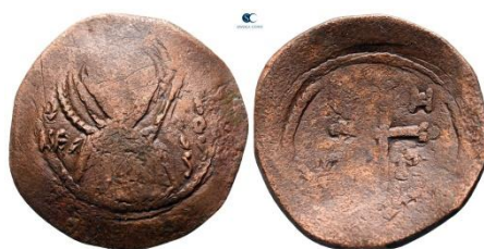
Fig. 10. New variety of Bohemond I

The coin illustrated as Fig. 10 recently appeared in trade. It seems to be a coin of Bohemond I but the lettering is quite different. The piece is double struck and of scyphate fabric. All that can be said for the present is that it is unlike any other published coin of Bohemond I.