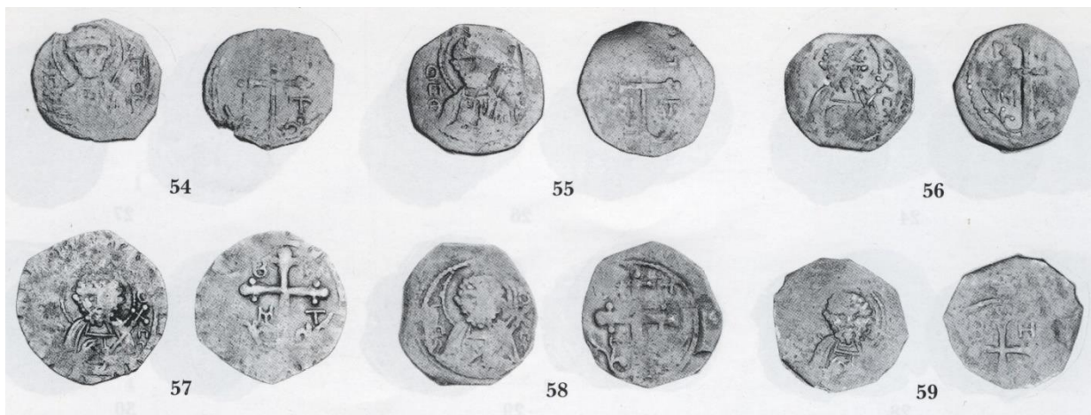
Fig. 4. Lots 54 to 59 in the Slocum collection

The coin illustrated by Schlumberger (Fig. 2) was rather different from other known examples (Fig. 3). On the obverse the drapery of the bust was different and the staff of the cross obliterated part of the nimbus. On the reverse the arms of the cross were thinner and the ornamentation at the ends was simpler. No one seems to have commented on this and it may have been assumed that the drawing in Schlumberger was inaccurate. That would have been unfair as Dardel's illustrations in Numismatique de l'Orient Latin are uniformly excellent. It was only with the sale of the Slocum collection that the situation became clear (Fig. 4). This contained six coins of Bohemond I, two in the style of Schlumberger's coin (lots 54–55), and four in the more familiar style (lots 56–59). In the following I have arbitrarily designated the first two as type 1 and the last four as type 2.