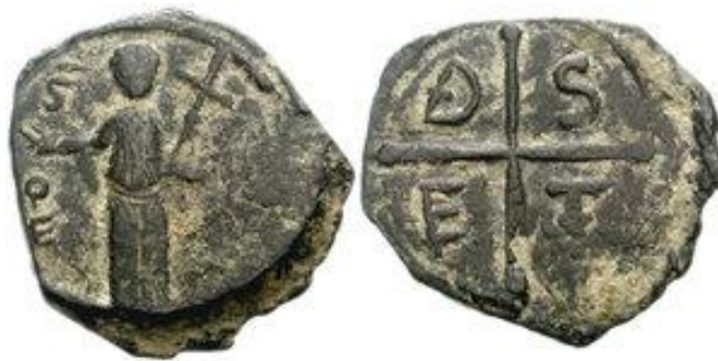
Fig. 1a. Class 3 follis of Tancred not overstruck

The main purpose of this article is to publish just such an overstrike (Fig. 1). It is a type 3 of Tancred which shows a standing figure of St Peter on the obverse and a cross with the letters D S F T ( domine salvum fac Tancredum ) in the angles, on the reverse. The floreate base of the cross is clearly visible as an undertype at 5 o’clock on the obverse (Fig. 1b). The bust of St Peter with traces of the inscription is clearly visible under the reverse cross and indeed obliterates the D and F of the inscription.