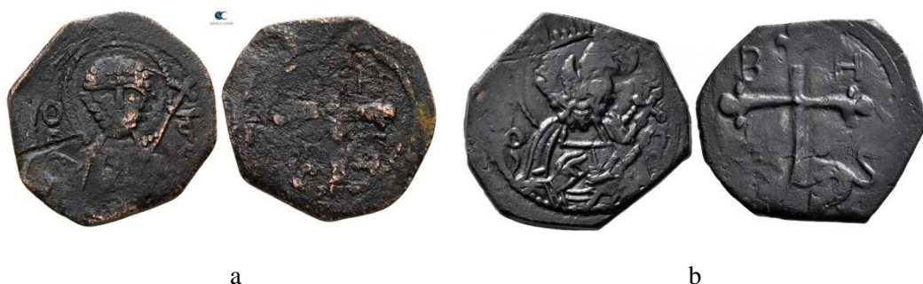
Fig. 7a. Type 1 of Bohemond with thick cross

In practice there is some overlap between the types. The reverse cross on Slocum 59 is quite thin. Examples exist of type 1 with a thick reverse cross though the ends seem to be the simplified type (Fig. 7a). Coins of type 2 sometimes have a thin cross though the ornaments at the end of the arms are, where visible, typical for type 2. The coin illustrated as Fig. 7b clearly shows the Seljuk undertype.