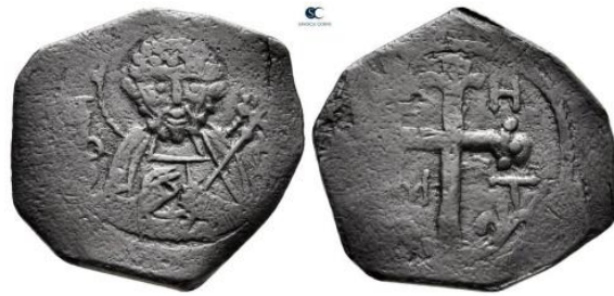
Fig. 3. Bohemond I follis

The coin illustrated by Schlumberger (Fig. 2) was rather different from other known examples (Fig. 3). On the obverse the drapery of the bust was different and the staff of the cross obliterated part of the nimbus. On the reverse the arms of the cross were thinner and the ornamentation at the ends was simpler. No one seems to have commented on this and it may have been assumed that the drawing in Schlumberger was inaccurate. That would have been unfair as Dardel's illustrations in Numismatique de l'Orient Latin are uniformly excellent. It was only with the sale of the Slocum collection that the situation became clear (Fig. 4). This contained six coins of Bohemond I, two in the style of Schlumberger's coin (lots 54–55), and four in the more familiar style (lots 56–59). In the following I have arbitrarily designated the first two as type 1 and the last four as type 2.