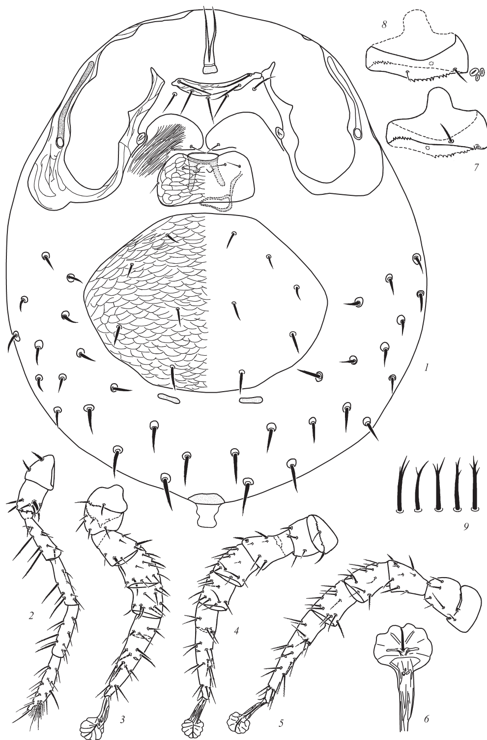
Fig. 2. Parantennulus scolopendrarum , ♀: 1 — idiosoma, ventral view; 2–5 — legs I–IV, respectively; 6 — ambulacrum; 7 — coxa II, ventral view; 8 — coxa II, dorsal view; 9 — variety of forms of additional setae on coxa II.

Рис. 2. Parantennulus scolopendrarum , ♀: 1 — идиосома, вентрально; 2–5 — ноги I–IV, соответственно; 6 — амбулакрум; 7 — тазик II, вентрально; 8 — тазик II, дорсально; 9 — изменчивость формы дополнительной щетинки на тазике II.