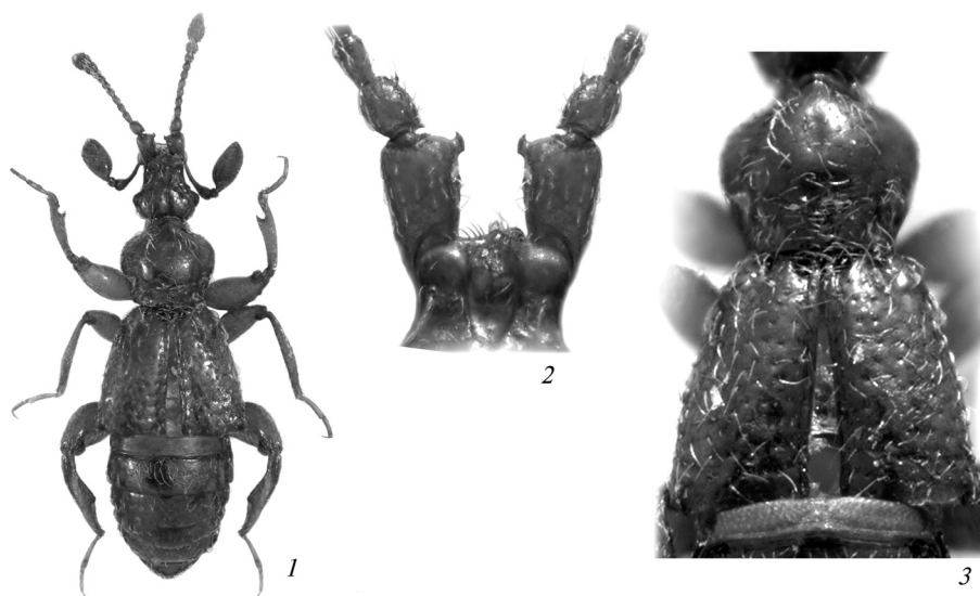
Fig. 1. Bryaxis moczarskii : 1 — habitus (dorsal view); 2 — the first three antennal segments; 3 — pronotum and elytra, dorsal view.

Рис. 1. Bryaxis moczarskii : 1 — общий вид сверху; 2 — три первых сегмента антенн; 3 — переднеспинка и надкрылья, сверху.