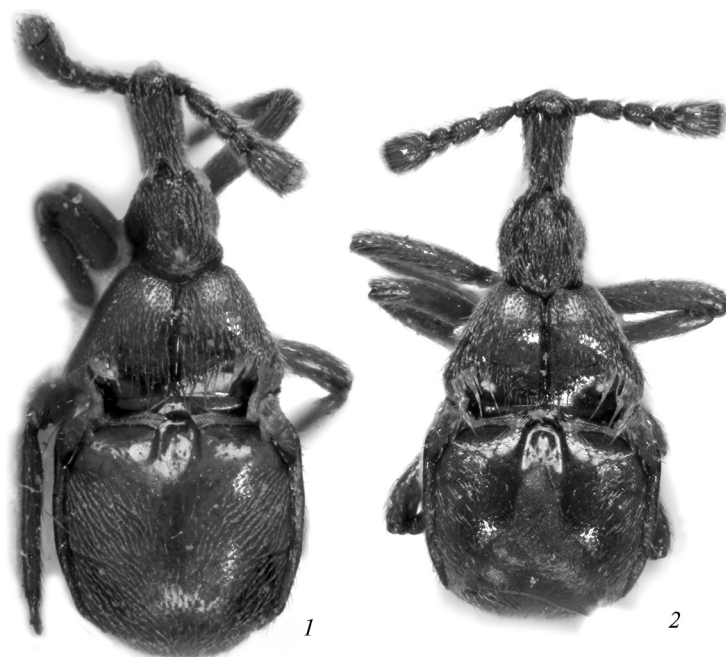
Fig. 3. Claviger colchicus : 1, 2 — habitus (dorsal view).

Рис. 3. Claviger colchicus : 1, 2 — общий вид сверху.