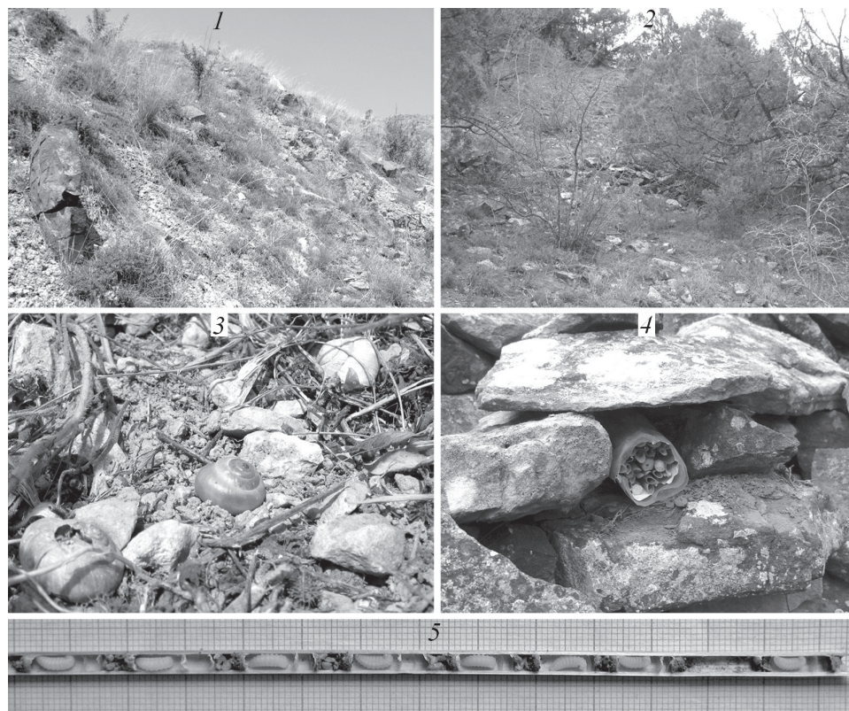
Fig. 1. Nesting of Leptochilus alpestris and L. regulus : 1 — nesting site of L. alpestris in Lisy Bay; 2 — nesting site of L. regulus in Karaul-Oba Mountain; 3 — shell of Monacha fruticola with the nest of L. alpestris under a stone; 4 — trap-nest with the nest of L. regulus ; 5 — dissected reed stem with the nest of L. regulus .

Рис. 1. Гнездование Leptochilus alpestris и L. regulus : 1 — станция гнездования L. alpestris в Лисей бухте; 2 — станция гнездования L. regulus на горе Караул-Оба; 3 — раковина Monacha fruticola с гнездом L. alpestris под камнем; 4 — искусственная гнездовая конструкция с гнездом L. regulus ; 5 — вскрытый стебель тростника с гнездом L. regulus .