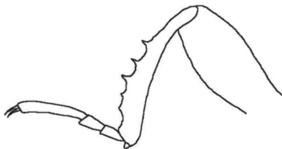
Fig. 2. Revelieria groehni sp. n., fore leg.

Рис. 2. Revelieria groehni sp. n., передняя нога.