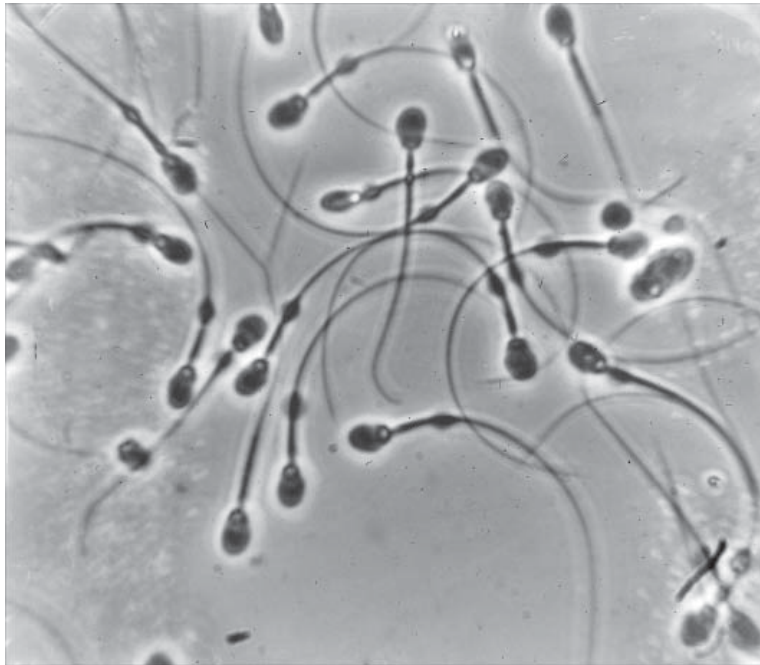
Fig. 1. Spermatozoa of male, examined in April. Phase contrast. 280 \times .

Рис. 1. Спермии самца, исследованного в апреле. Фазовый контраст. 280 \times .