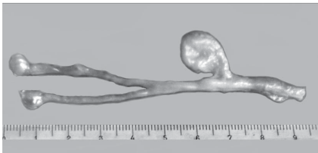
Fig. 4. The uterus of pregnant female, studied 31 December; in the right horn the highlighted location of blastula.

generalized indicator of female's pregnancy of stone marten ranges within 236–274 days. Considering its relative affinity to the forest marten (Shtreyli, 1934), it can be stated, that some of its processes are in the same sequence, applied to puberty, manifestation of sexual activity, timing of mating, fertilization and duration of pregnancy. Data of our research of detailed study of their genitalia conducted within 5 years indicate this (table 2). Of 12 examined females — 3 were pregnant, other females were unfertilized or at the stage of puberty. Reproductive organs of a young (one year) female were in juvenile condition and weighed only 0.7–0.8 g, including ovaries — 0.024 \pm 0.004 g; only primordial and cavitory follicles 250–500 microns in diameter, which gradually degenerated in the early stages of development, were recorded. In the two years old females weight of genitala slightly increased and ranged 0.84–1.1 g, ovary weight — 0.041 \pm 0.006 g; small follicles with a diameter of 1.5 mm and a separate atretic body were recorded. In the ovaries of one adult female, studied on the first decade of August, 2–3 follicles 1–1.5 mm in diameter were recorded in each ovary; their weight was 180 mg. The weight of the uterus was 1.8 g, the length of right corner — 3.2 cm; left — 4.2 cm. Judging the state of the genitala, it might give birth this year.