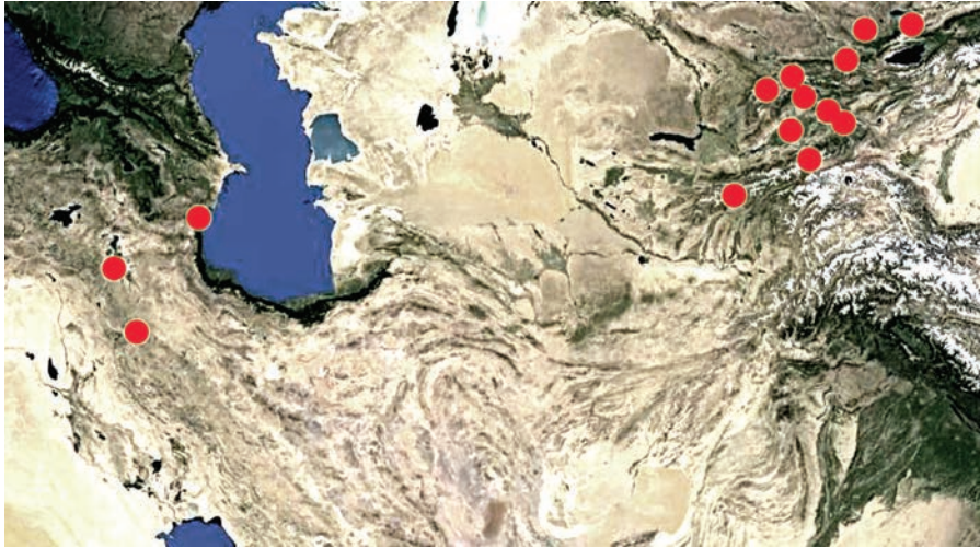
Fig. 4. Distribution of T. kogardtauca in the Middle East.

Рис. 4. Распространение T. kogardtauca на Среднем Востоке.