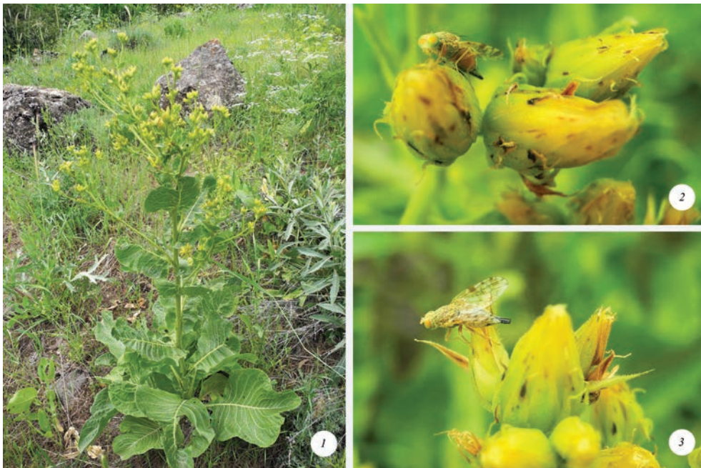
Fig. 3. Inula stenocalathia (Rech. f.) Soldano, the host plant of T. kogardtauca (1), and a female of T. kogardtauca (2, 3) on its flower heads.

Wing (fig. 1, 3) with reticulate pale brownish yellow pattern. Cells bc and c hyaline. Pterostigma brown, without hyaline spots. Cell r_1 posterior to pterostigma brownish yellow, two trapeziform hyaline spots distal to R_1 apex separated by narrow brown band; apex of cell r_1 entirely brownish yellow. Cell r_{2+3} hyaline at base, with dark area posterior to