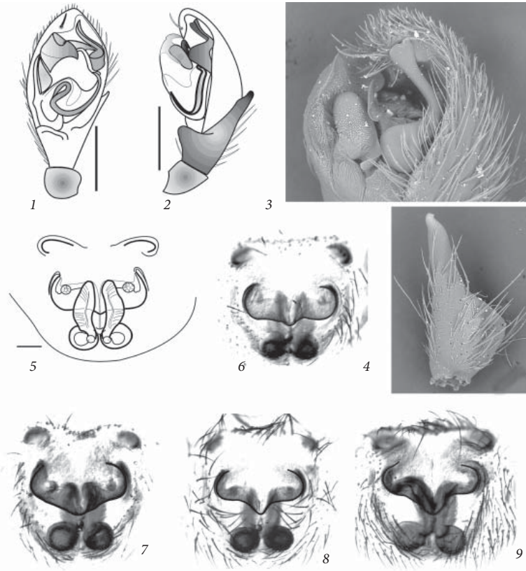
Fig. 2. Copulatory organs of Z. azsheganovae : 1–3 — male palp, ventral (1), retrolateral (2, 3) view; 4 — palp tibia, lateral view; 5 — endogyne, ventral view; 6–9 — variation of epigyne, ventral view (1–2 — Chernihiv Region, Novhorod-Siverskyi; 3–4 — Chelyabinsk Region, Ilimenskiy Reserve; 5–9 — Sumy Region, Vakalivshchyna Vil.). Scale 0.5 mm.

forest edges (Sychev). Cherniavka Distr. Albiny, 51°03'49" N 37°37'05" E: 5 ♂ (NYP), 20.07.2011, 1 ♂ (NYP), 24.07.2012, 1 ♀ (NYP), 19.07.2013. Perelesok, 50°59'35" N 37°35'25" E: 6 ♂, 1 ♀ (NYP), 2011, 7 ♂, 4 ♀ (NYP), 28.07.2012, 6 ♂, 5 ♀ (NYP), 20.07.2013. Prostoye, 51°05'16" N 37°41'53" E: 1 ♂ (NYP), 12.06.2013, 1 ♂ (NYP), 09.06.2013, 1 ♀ (NYP), 19.07.2013; Osinnik 51°03'01" N 37°39'15" E: 1 ♂ (NYP), 21.07.2011, 1 ♂ (NYP), 12.06.2013, 1 ♀ (NYP), 20.07.2013. Reznikov Yar, 51°01'01" N 37°39'41" E: 1 ♂ (NYP), 25.07.2012, 1 ♂ (NYP), 08.06.2013, 1 ♂ (NYP), 28.07.2013. In all localities in meadow vegetation on the forest edges (Sychev). Ukraine. Sumy Region. Trostianets, 50°28'59" N 34°54'40" E: 1 ♂ (NYP), 15.06.2013, edge of plain Quercus forest;