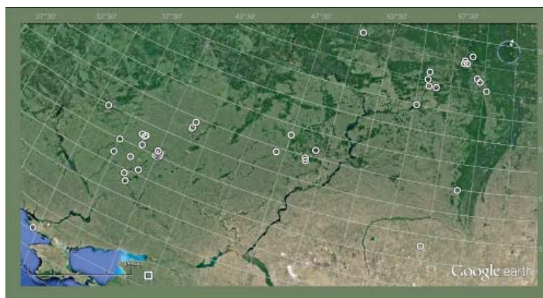
Fig. 1. Map of collecting localities of Z. azsheganovae on the East European Plain. Circles — authors' material; squares — literature data.