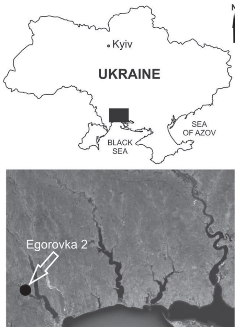
Fig. 1. Type locality Egorovka 2, Odesa Region (Ukraine).

The material under study is represented by disarticulated bones. These items are housed in the Paleontological Museum of the National Museum of Natural History (NMNH-P), National Academy of