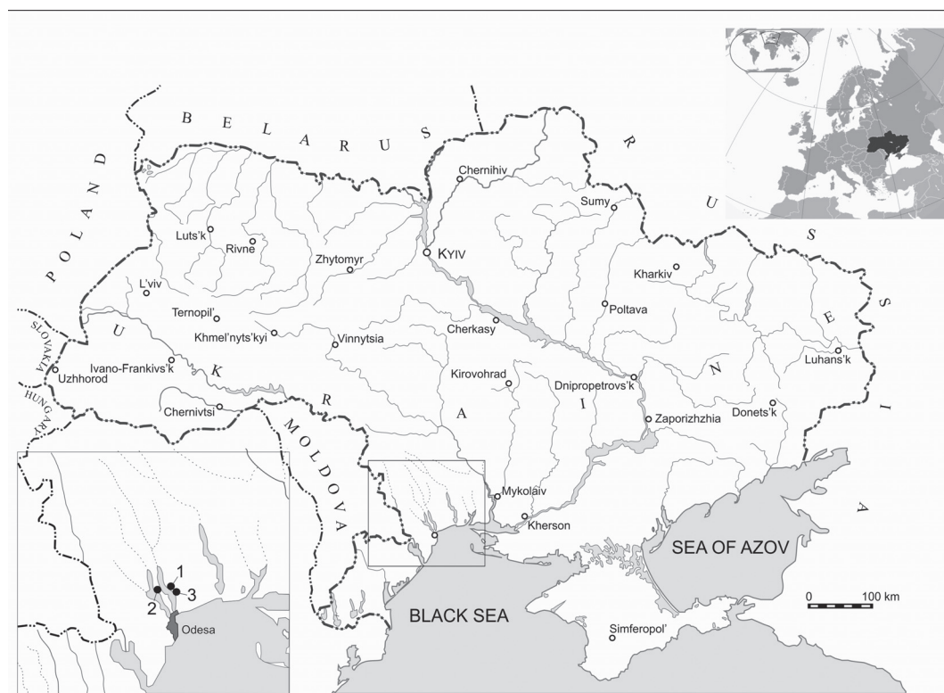
Fig. 1. Localities of the late Miocene huchen remains in Ukraine: 1 — Kubanka 2; 2 — Cherevychnoe 3; 3 — Tretya Krucha.

The fish material described here was recovered in the same microvertebrate sample obtained from dry screening as the small mammalian faunas previously described (Topachevsky et al., 2000; Sinita, 2005, 2011). It is derived from three late Miocene localities in southern Ukraine (fig. 1). Their age was established based on the small mammals (Nesin, Nadachowski, 2001) and is consistent with biostratigraphic dates derived from the accompanying fauna.