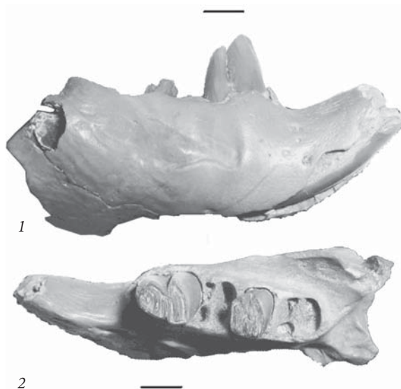
Fig. 2. Right mandible of Trogotherium (Euroxenomys) minutum rhenanum . Cherevichnoe 3 locality: 1 — labial view; 2 — view on the point of chewing surface. Scale bar 5 mm.

Description and comparison. P^4 from the numerous localities on the territory of Ukraine (fig. 3, 1) are characterized by a somewhat larger size as compared to the nominative subspecies and those from Dorn-Dürkheim. The height of the tooth crown is on average 4.2 mm (maximum — up to 8.0 mm), length — within the range of