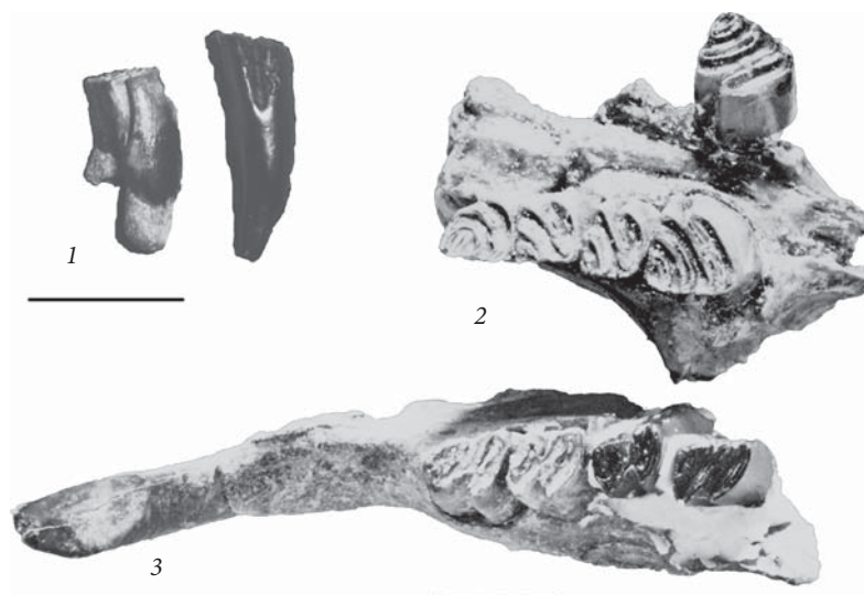
Fig. 1. Chewing surface of upper (1) and restored lower (2) dentition, character of the molar roots development (3) of Trogontherium (Euroxenomys) minutum minutum from the Grytsev locality. Scale bar 5 mm.

According to Lychev (1973, 1983), fossil remains of T. (Euroxenomys) minutum from the Late Miocene of Ukraine, including the material from Grytsev, are belonging to Monosaulax savinovi , typical North American and Asian species. Molars from Grytsev (fig. 1, 3) have relatively smaller crowns and less-developed roots than those in Monosaulax savinovi , which was described from the Miocene of Kazakhstan.