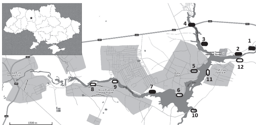
Fig. 2. List and location of the studied sites: 1 — cliffs to east of the resort Denyshy (28.39 E, 50.20 N); 2 — dam across the Teteriv River near the resort Denyshy (28.38 E, 50.20 N); 3 — river bank to the west from the UVD resort (mouth of the Bobrovka River; 28.36 E, 50.21 N); 4 — bridge over the Bobrovka River (28.36 E, 50.21 N); 5 — bay in Buky Village (28.36 E, 50.20 N); 6 — cape in Buky Village (28.35 E, 50.19 N); 7 — cliffs between Buky Village and country houses (28.34 E, 50.19 N); 8 — river bank in Rudnya-Nova Village (28.30 E, 50.19 N); 9 — cape in Rudnya-Nova Village (28.32 E, 50.19 N); 10 — bridge over the Glubochok River (28.36 E, 50.18 N); 11 — river bank in Tryhirya Village (28.37 E, 50.19 N); 12 — right bank of the Teteriv River near dam (28.38 E, 50.20 N). Sites where lizards were found are marked by black color.

bridge were found about 10 juvenile D. armeniaca . Thus in total, length of the distribution area of the species is about 3.7 km (distance between sites 1 and 4).