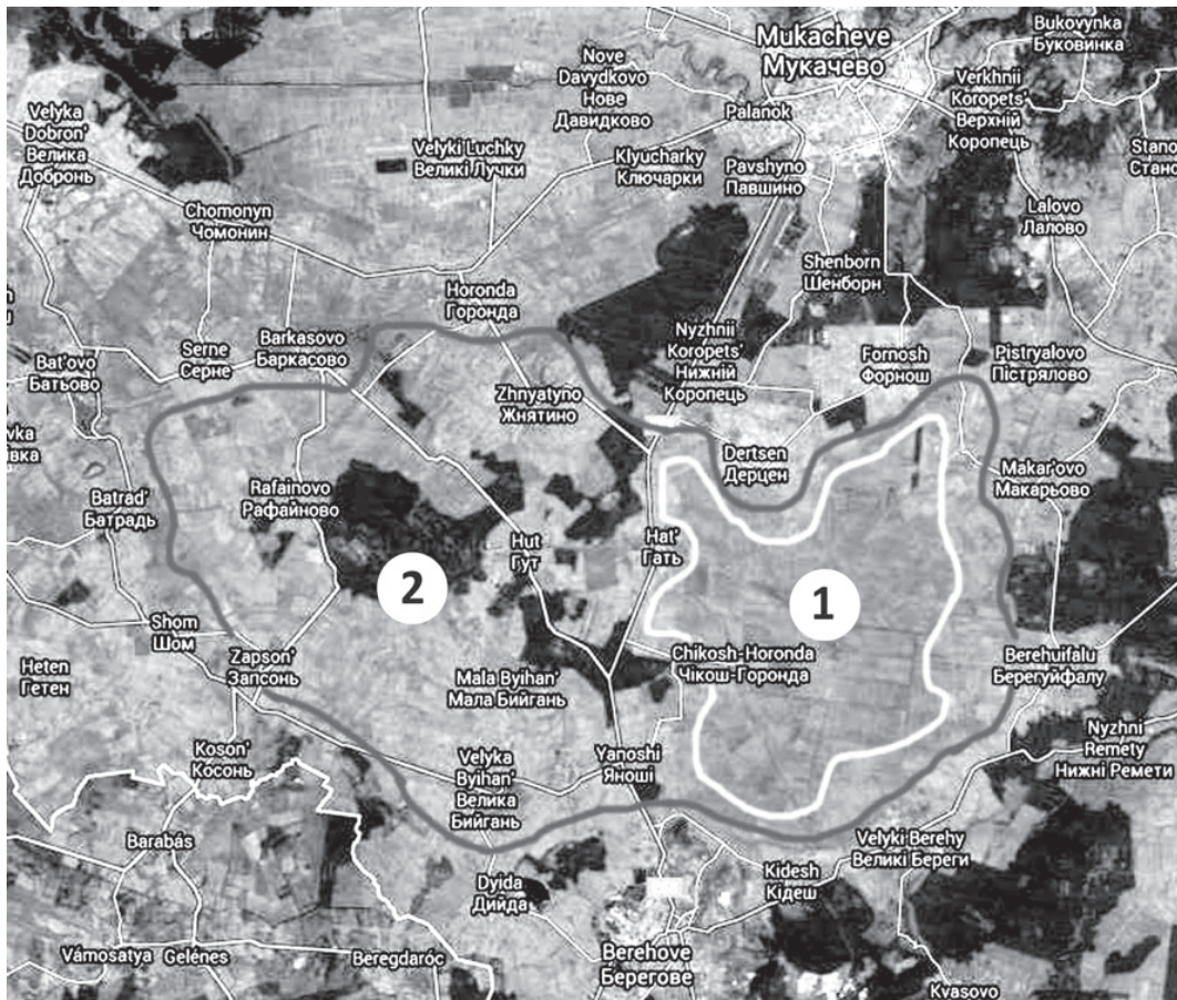
Fig. 1. The Chornyi mochar tract. Google map with modifications:

1 — the area of the former Great Lake; 2 — the general boundaries of the tract accepted in the present work.