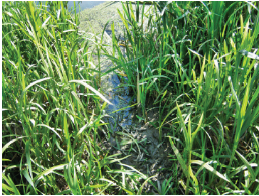
Fig. 4. A beaver slide.