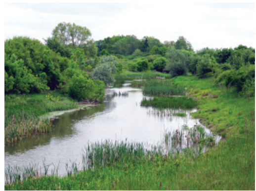
Fig. 7. The channel's course at location 3 (see fig. 8).