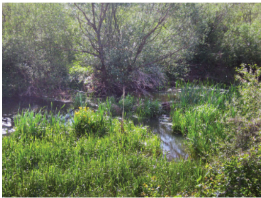
Fig. 6. The channel's course at location 2 (see fig. 8).