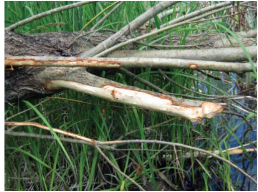
Fig. 5. Recently gnawed branches of a juvenile aspen.