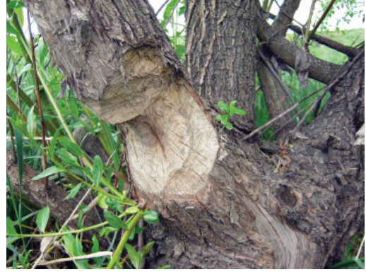
Fig. 3. A branch of a riparian willow gnawed earlier.