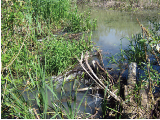
Fig. 2. A part of the first beaver dam.