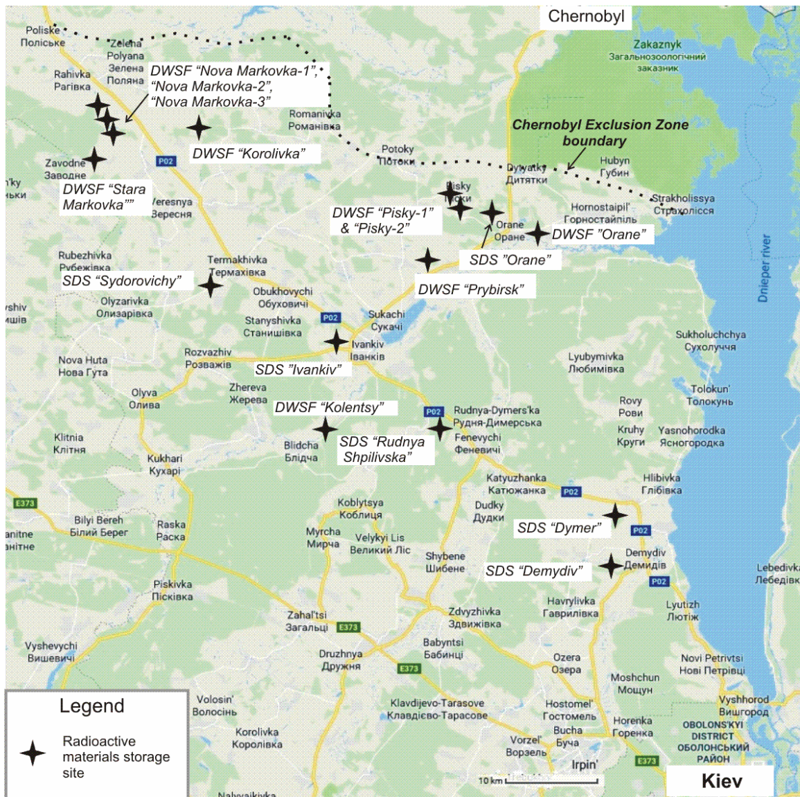
Fig. 2. Map of the studied Chernobyl radioactive legacy sites in Kyiv region.

was carried out by State Enterprise (SE) “NTC KORO” in order to update data from surveys carried out in 1993 - 1994. These studies have shown that the major contributors to the radioactive inventory of legacy waste storage sites at the present time are ^{137}\text{Cs} and (to a lesser degree) ^{90}\text{Sr} . In a few cases ^{241}\text{Am} was found in activities exceeding exemption levels for low level waste. Maximum ^{137}\text{Cs} activity in stored wastes ranged for different facilities from 0.4 to 300 kBq/kg; maximum ^{90}\text{Sr} activity ranged from 0.1 to 100 kBq/kg; maximum ^{241}\text{Am} activity reached 6 kBq/kg. In many cases the activity of stored materials is below the relevant threshold activity criteria (exemption levels) for radioactive wastes defined by Ukrainian regulations (e.g., 10 Bq/g for ^{137}\text{Cs} ) [8]). At the same time, these materials usually have specific activity above the clearance levels (e.g., 0.1 Bq/g for ^{137}\text{Cs} ) [9].